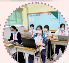
社際比賽 Inter-House Competition